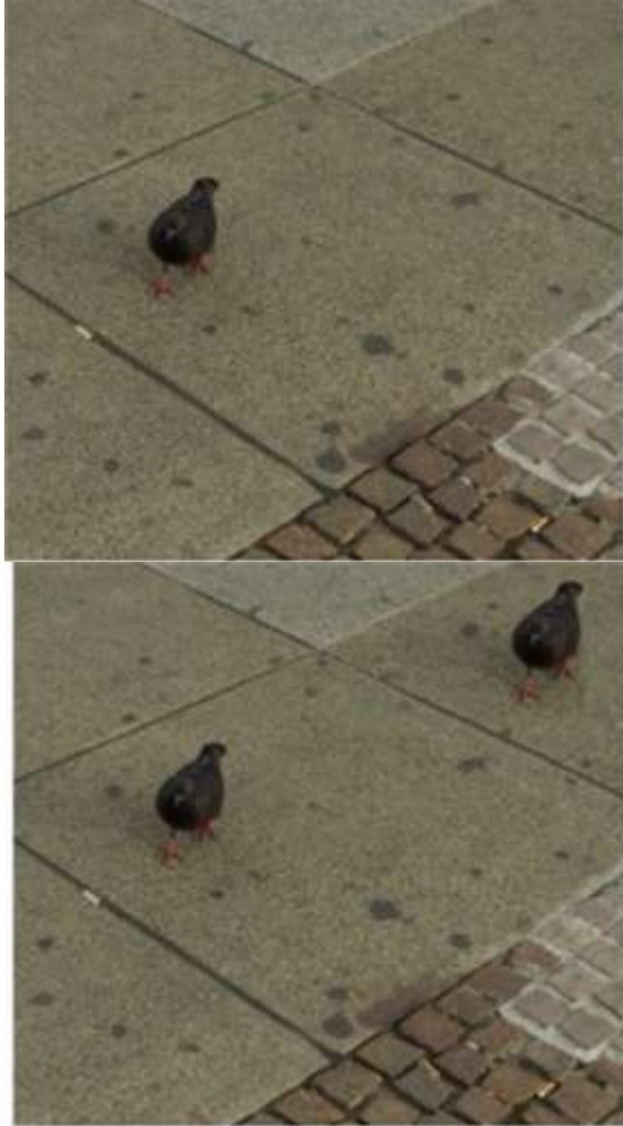
Fig.3. Example of Copy-Move attack

copied and pasted into another part of same image itself. In the copy and move attack, the intention is to hide something in the original image. For hiding the information that particular part of the image has to be masked with the copied region. The example of Copy-Move type is as shown in below figure 3 below. The original image contains only one pigeon and its Copy-Moved version on the right has two pigeons. This type of forgery detection is very crucial in the field of defense and legal documents.