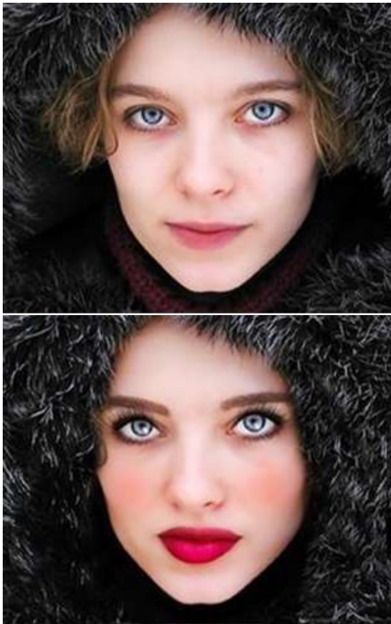
Fig.1. Example of Image Retouching

Image Retouching generally can be used for enhancing the certain features of the image. These features include image color, sharpness, brightness etc etc. Retouching is less harmful forgery technique when compared to the all other types at present. With the image retouching original image does not changes much, but it enhances or reduces certain feature of original image. This technique is popular among magazine photo editors. Even this technique is ethically wrong, while publishing a picture some features need to be enhanced. For this enhancement image retouching can be done.so this can be called as magazine publishing technique.