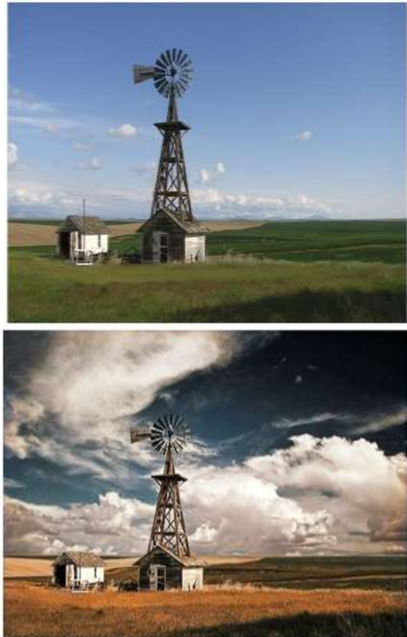
Fig.2. Example of Image splicing

Image splicing technique is more dangerous than image retouching. Image splicing is simple process. This process can be carried out on two separate pictures involves copy and pasting different regions. In this method it requires simple tools like adobe photoshop for sticking two different images. With use of Microsoft paint also everyone can perform some basic level of image splicing. Image splicing or photomontage is composition of two or more images. This combination create a fake image. This image forgery technique become a tool for cyber bullying. From ordinary person to celebrity sometimes world leaders also becoming victims of cyber bullying. Fig. 2 below shows how to create forged Image; by copying a spliced portion from the source image into a target image, it is a composite picture of scenery which is forged image.