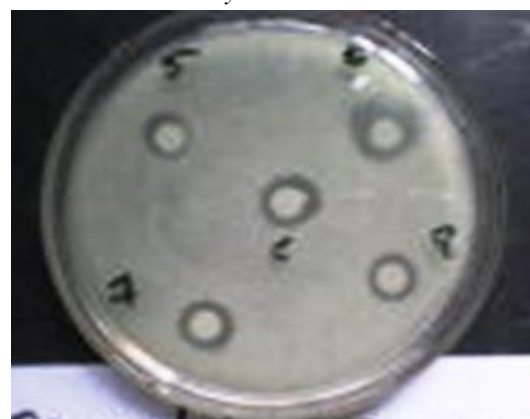
Fig 1: Pseudomonas aeruginosa

Ethanol extract of Phyllanthus emblica root