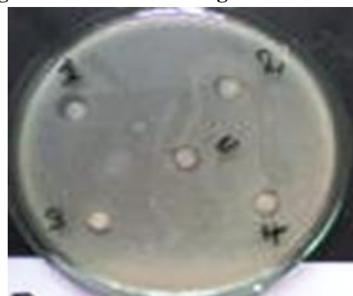
Fig 2: Salmonella