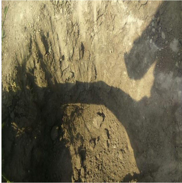
Fig: Black cotton soil at site

superstructure especially in case of soil which are highly active, also it saves a lot of time and millions of money when compared to the method of cutting out and replacing the unstable soil.